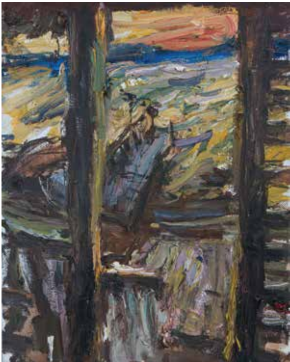
(LEFT) Midnight Sun on the Karelian Lakes (Finland) , 2021, oil on linen, 20 x 16 in. ■ (ABOVE) Brook (Caucasus Mountains, Russia) , 2013, oil on linen, 27 1/2 x 35 1/2 in.

Gleiter was glad to do so, relying heavily on such historical forerunners as Isaac Levitan (1860–1900).