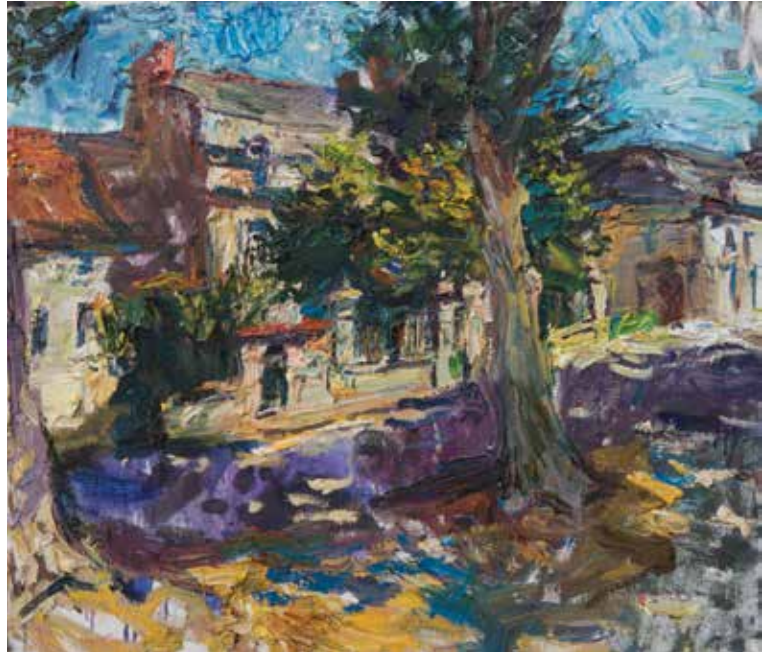
(LEFT) Cortijo in the Sierra Alhamilla (Andalusia, Spain) , 2021, oil on linen, 27 1/2 x 21 2/3 in. ■ (ABOVE) French Town , 2020, oil on linen, 28 x 32 in. ■ (BELOW) Dalmatian Coast (Near Dubrovnik) , 2018, oil on linen, 22 x 31 1/2 in.